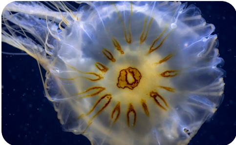
the round top of a jellyfish.